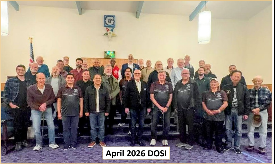
April 2026 DOSI