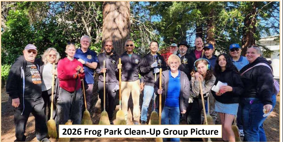
2026 Frog Park Clean-Up Group Picture