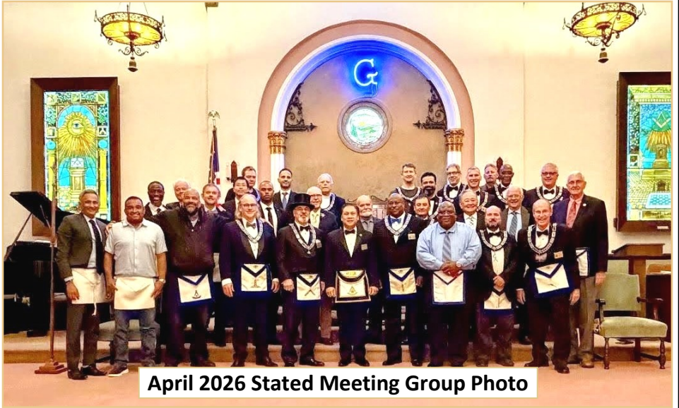
April 2026 Stated Meeting Group Photo