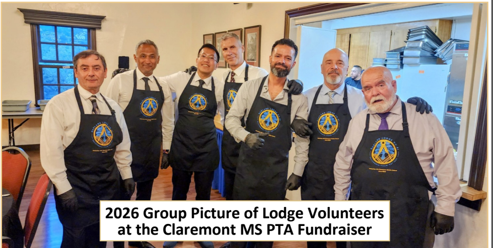
2026 Group Picture of Lodge Volunteers at the Claremont MS PTA Fundraiser