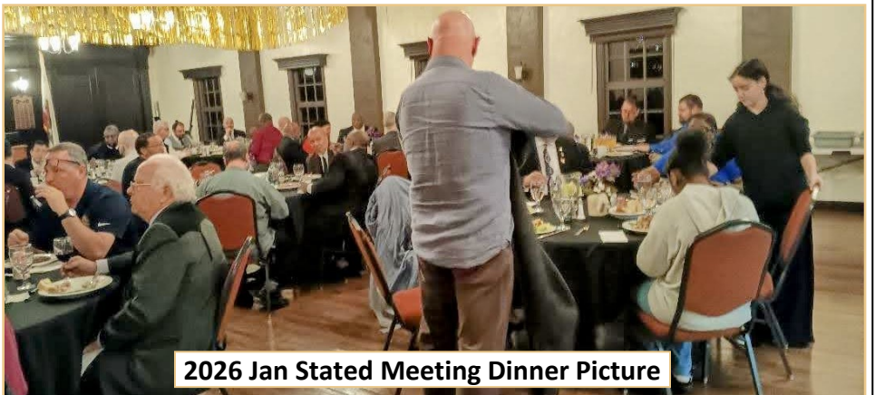
2026 Jan Stated Meeting Dinner Picture