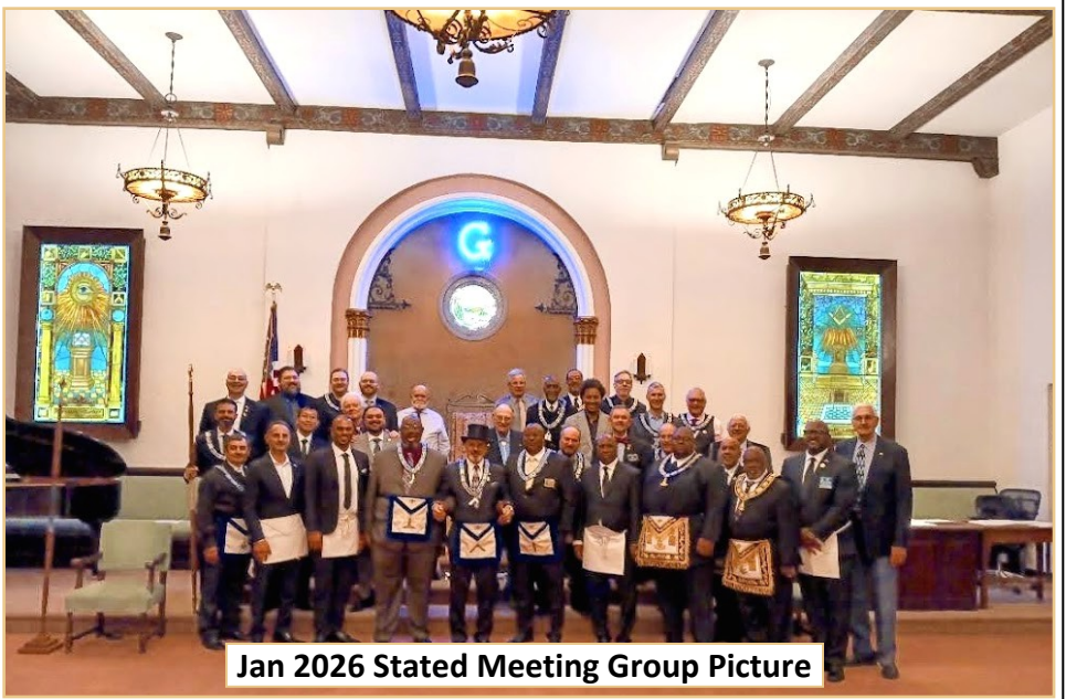
Jan 2026 Stated Meeting Group Picture