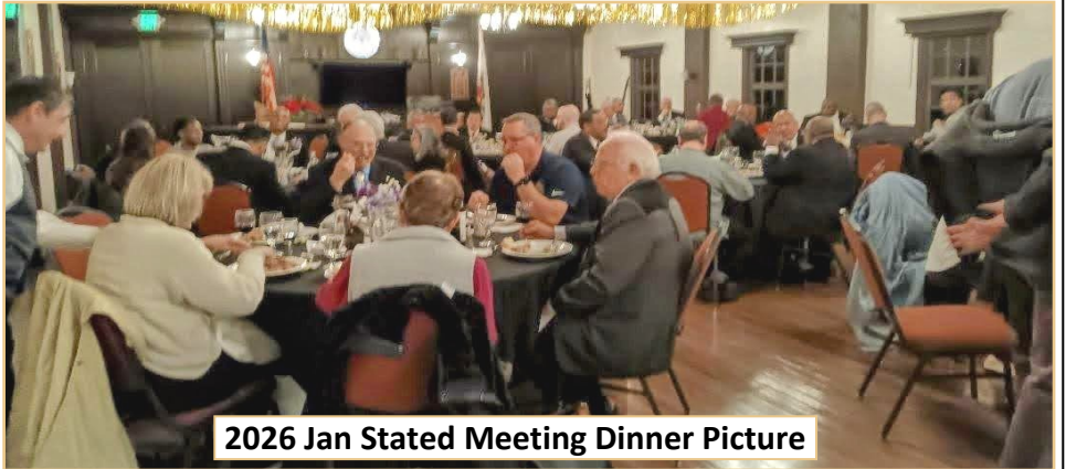
2026 Jan Stated Meeting Dinner Picture