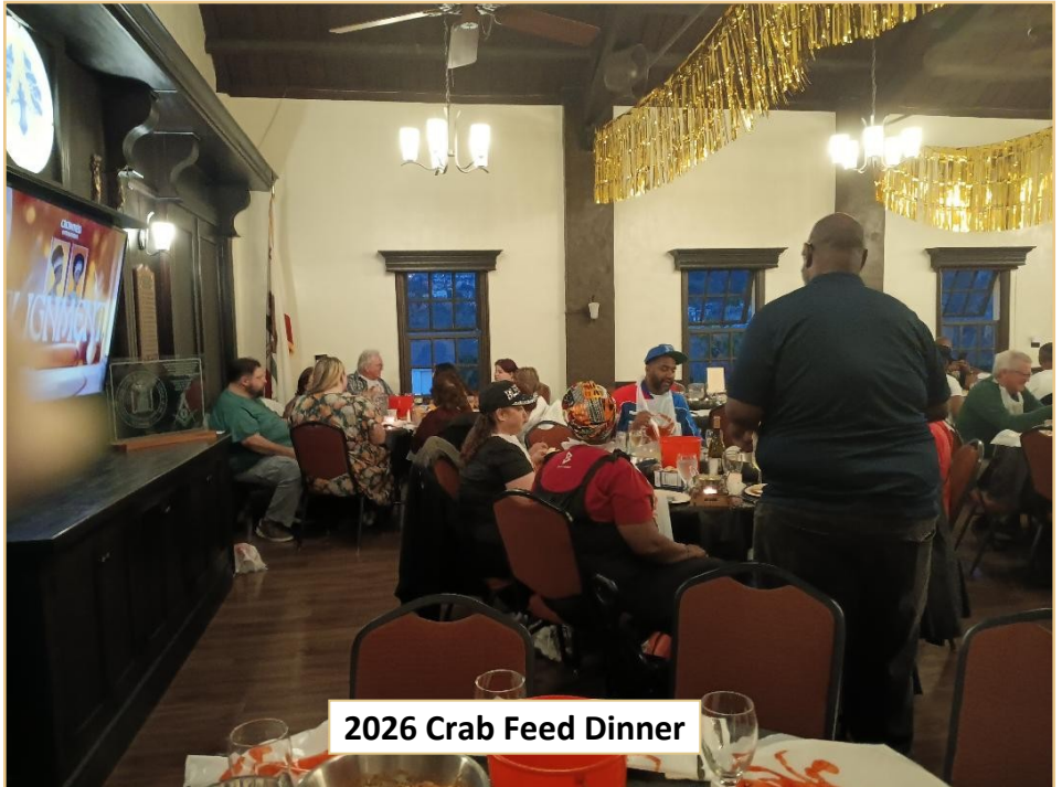
2026 Crab Feed Dinner