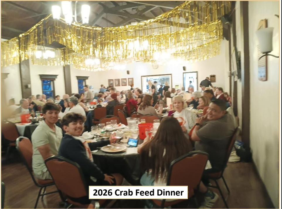
2026 Crab Feed Dinner