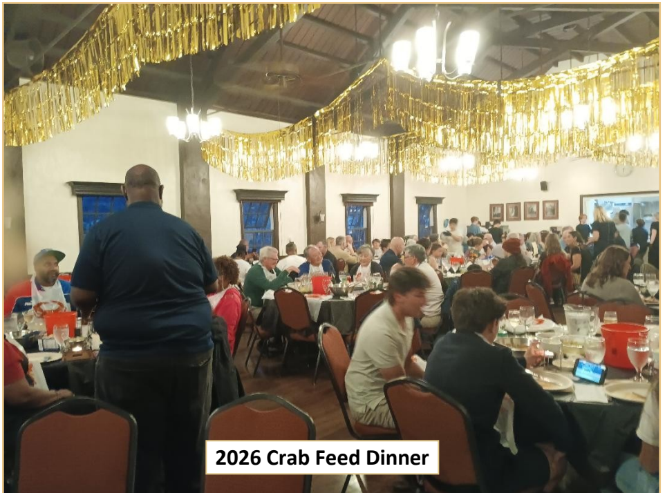
2026 Crab Feed Dinner