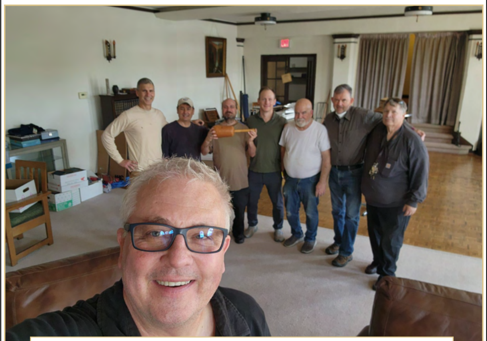
2nd Group photo of the March Lodge Clean-up participants