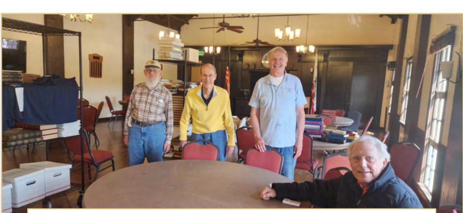
1st Group photo of the March Lodge Clean-up participants