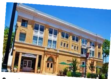
San Leandro Lodge No. 113