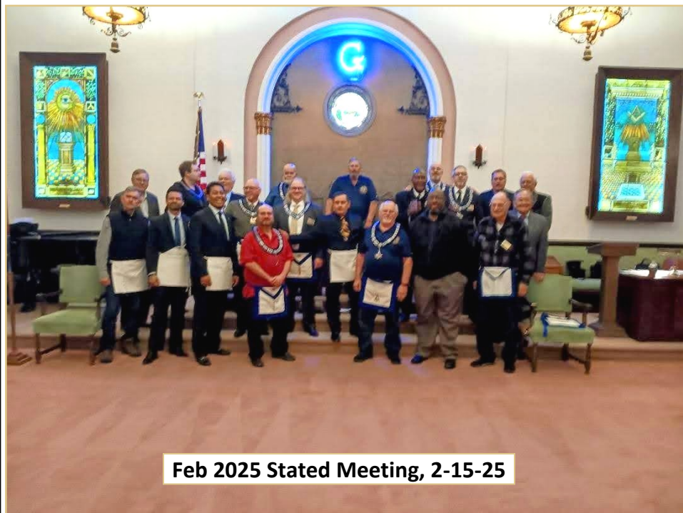
Feb 2025 Stated Meeting, 2-15-25