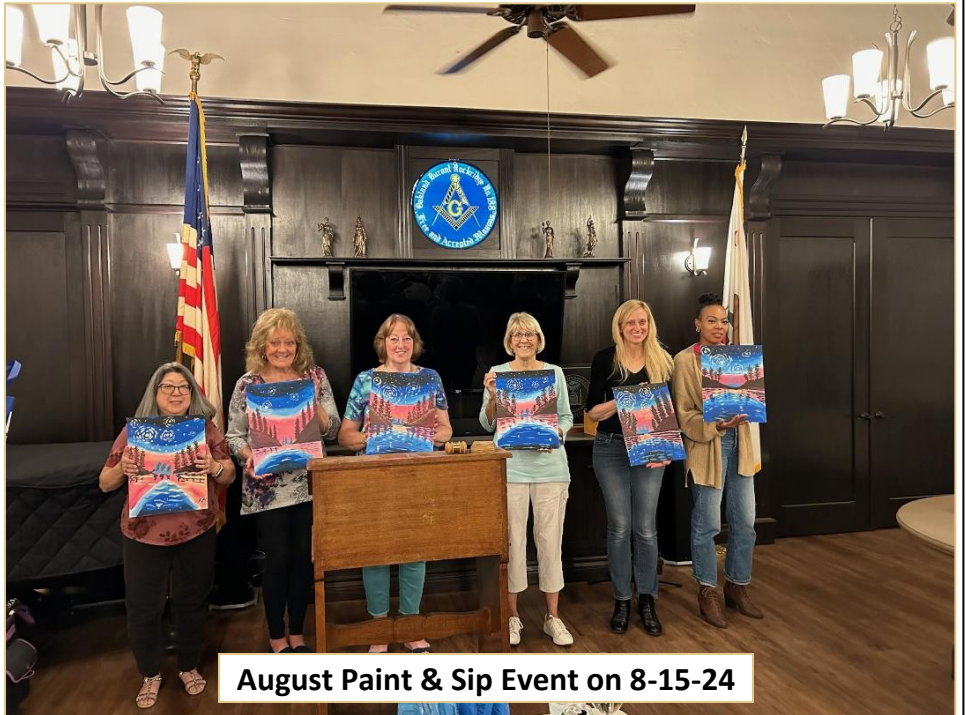
August Paint & Sip Event on 8-15-24