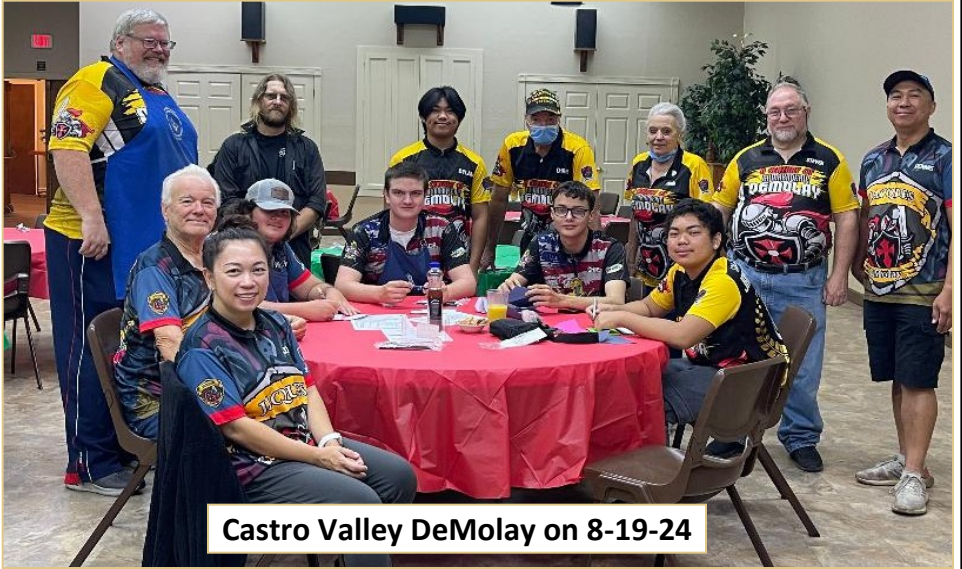
Castro Valley DeMolay on 8-19-24