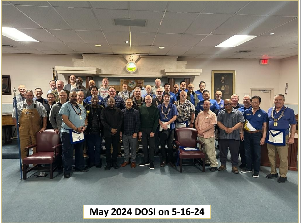
May 2024 DOSI on 5-16-24