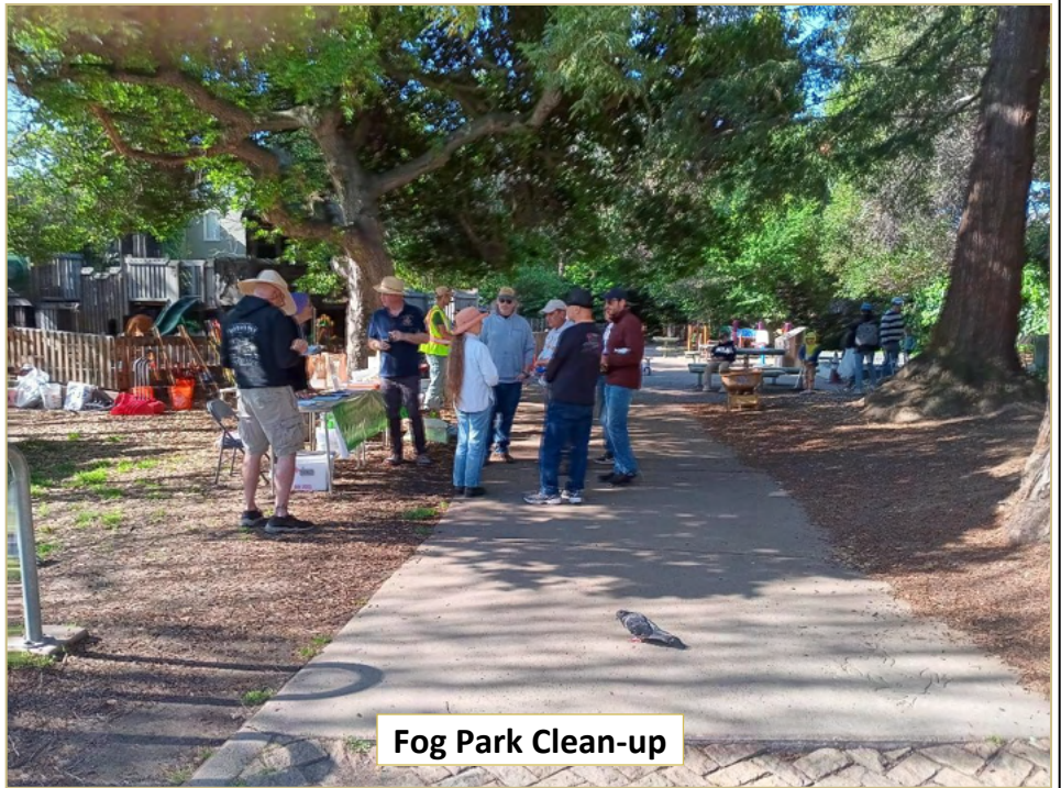
Fog Park Clean-up