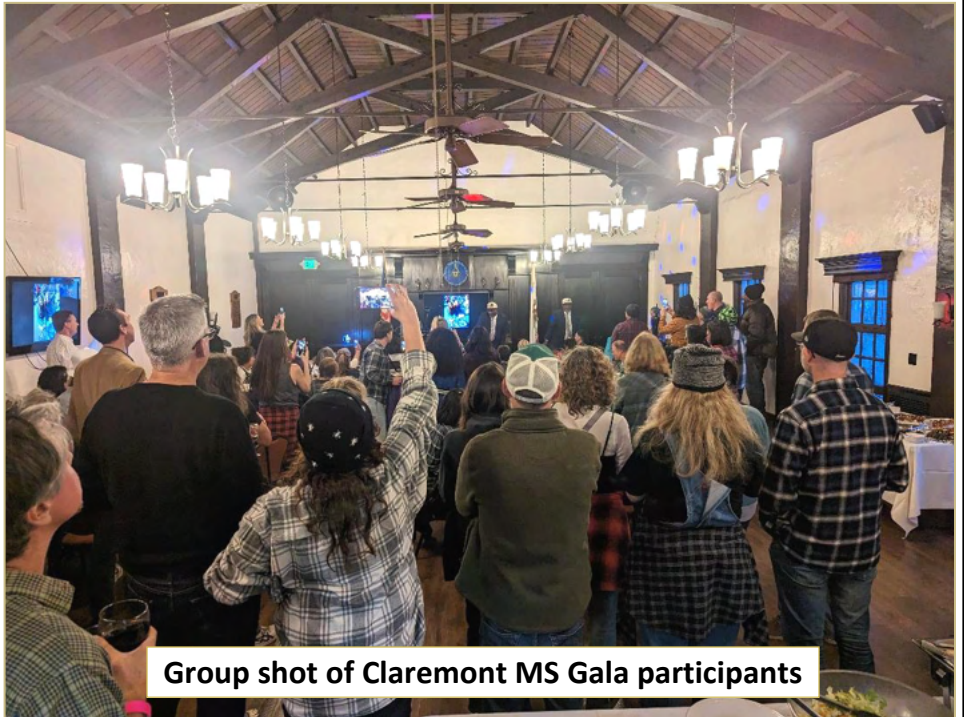
Group shot of Claremont MS Gala participants