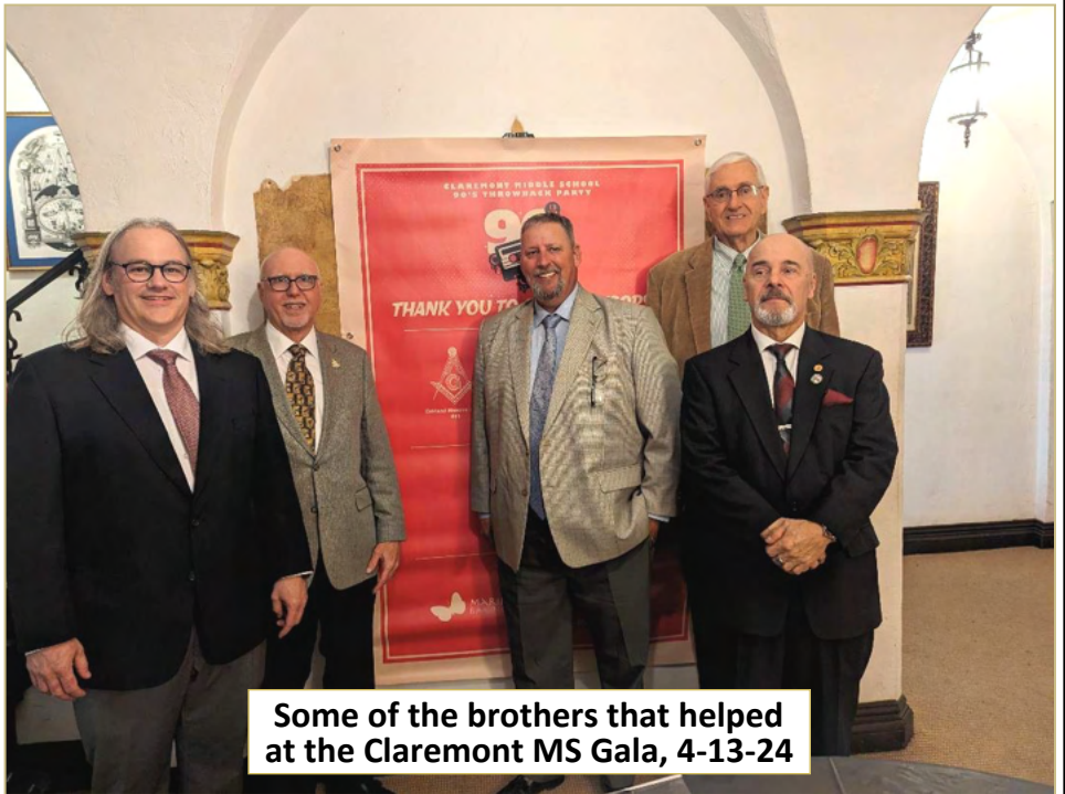
Some of the brothers that helped at the Claremont MS Gala, 4-13-24