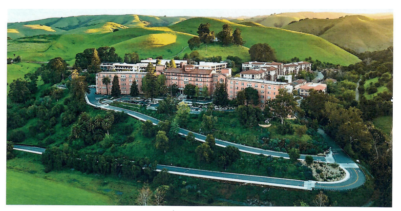
Now Serving Parents, In-Laws, and CA Masons of All Levels