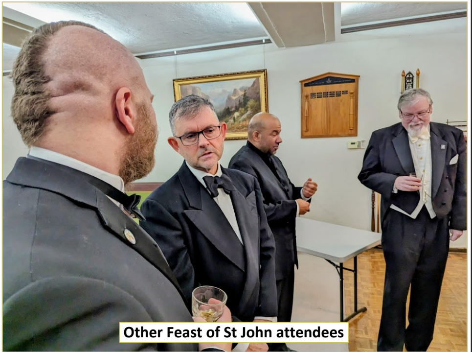
Other Feast of St John attendees