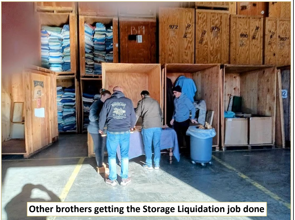
Other brothers getting the Storage Liquidation job done