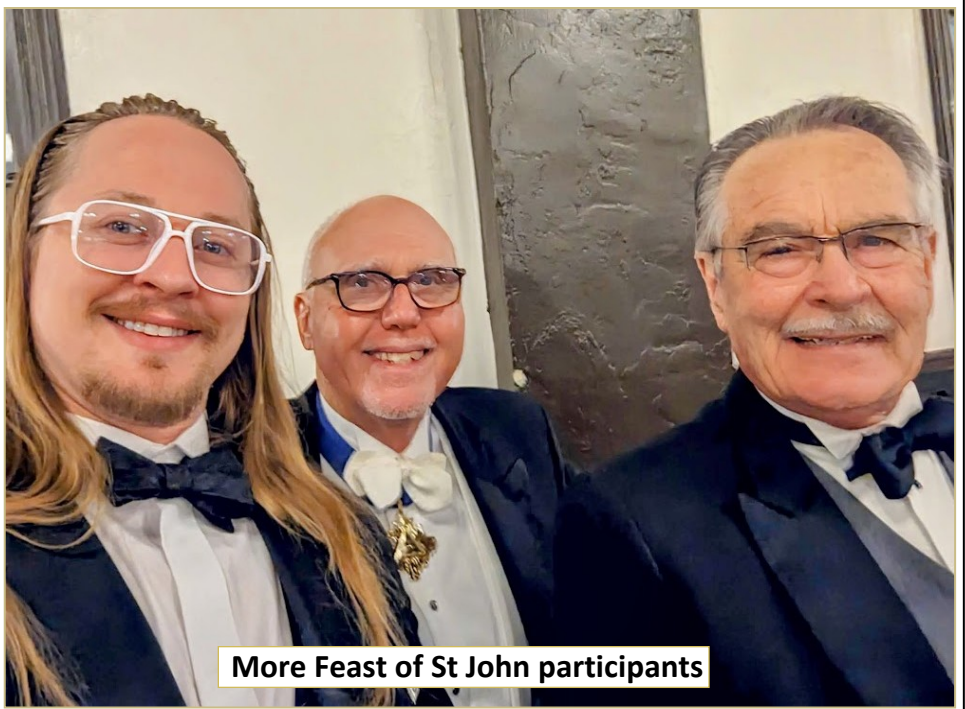
More Feast of St John participants